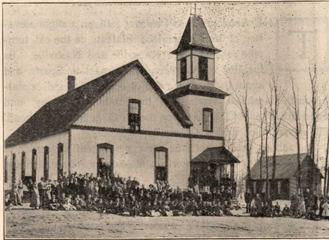
ACADEMY BUILDING was erected in 1885-6. It contains study rooms for Normal and Grammar Grades and three recitation rooms. It will accommodate from 200 to 225 students. This building is also used for religious services. The PRIMARY BUILDING to the right, built in 1849, will accommodate 75 children and is a model building for a district school house.

A chief requirement for admission is good moral character. Applicants from other schools should furnish evidence or honorable dismissal. Credit will be given for the studies pursued